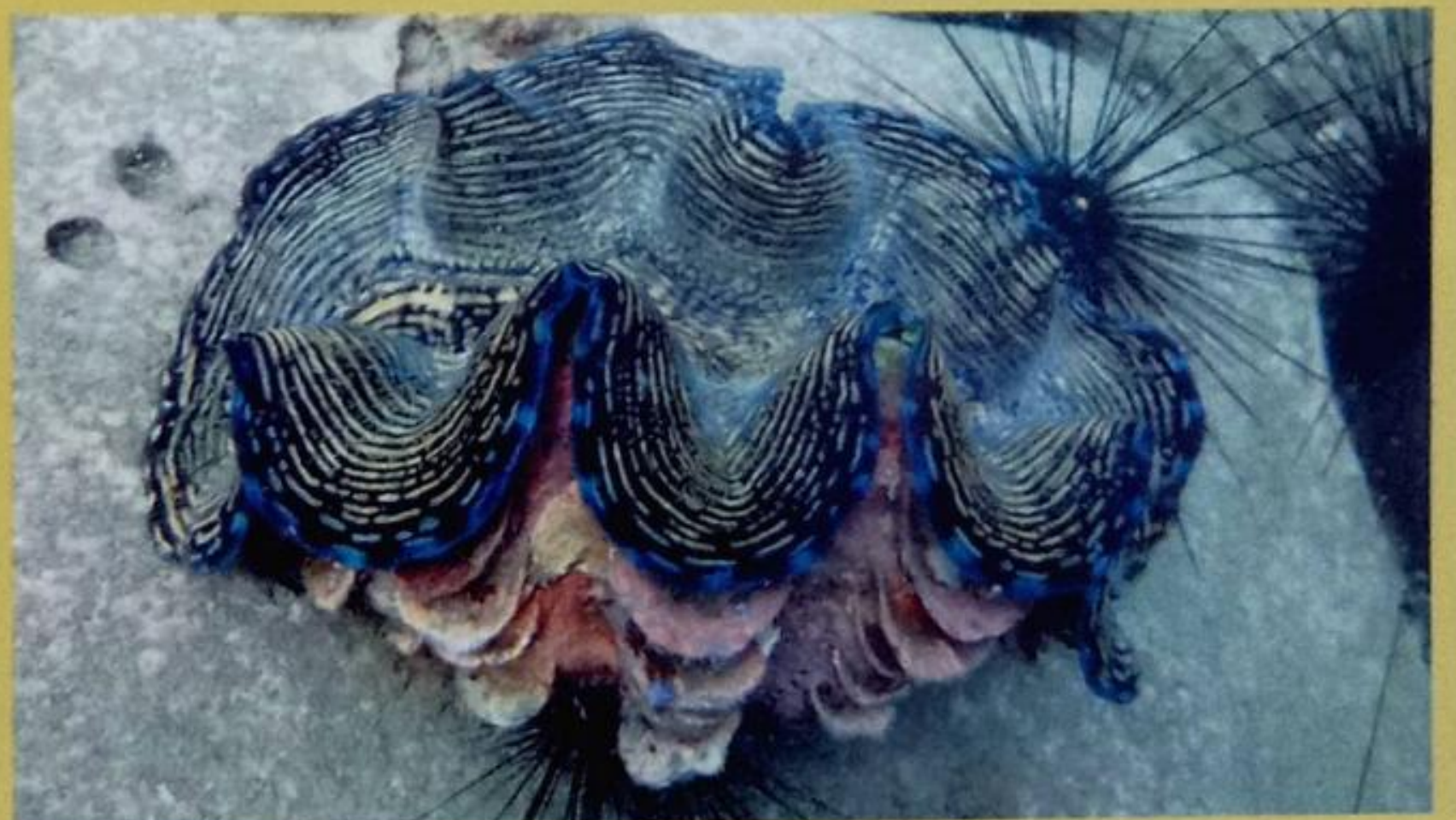
Main: Dive boat moored at the pier at sunset. Bottom Right: Giant clam Tridacna gigas (sideways), Coral.

The following day's dive was on the west side south of Koh Rong, another muck dive with coral bommies. I used a close-up outfit and was delighted to see quite a few nudibranchs such as Gymnodoris rubropapulosa with orange spots, white gills and orange rhinophores; Hypselodoris tryoni in tandem, Flabellina and Facelinidae , plus hermit crabs. The highlight was a pale gray catshark-like creature, whose tail stuck out from under a rock and the head appeared on the other side. It was the elusive brown banded bambooshark Chiloscyllium punctatum . Up to a